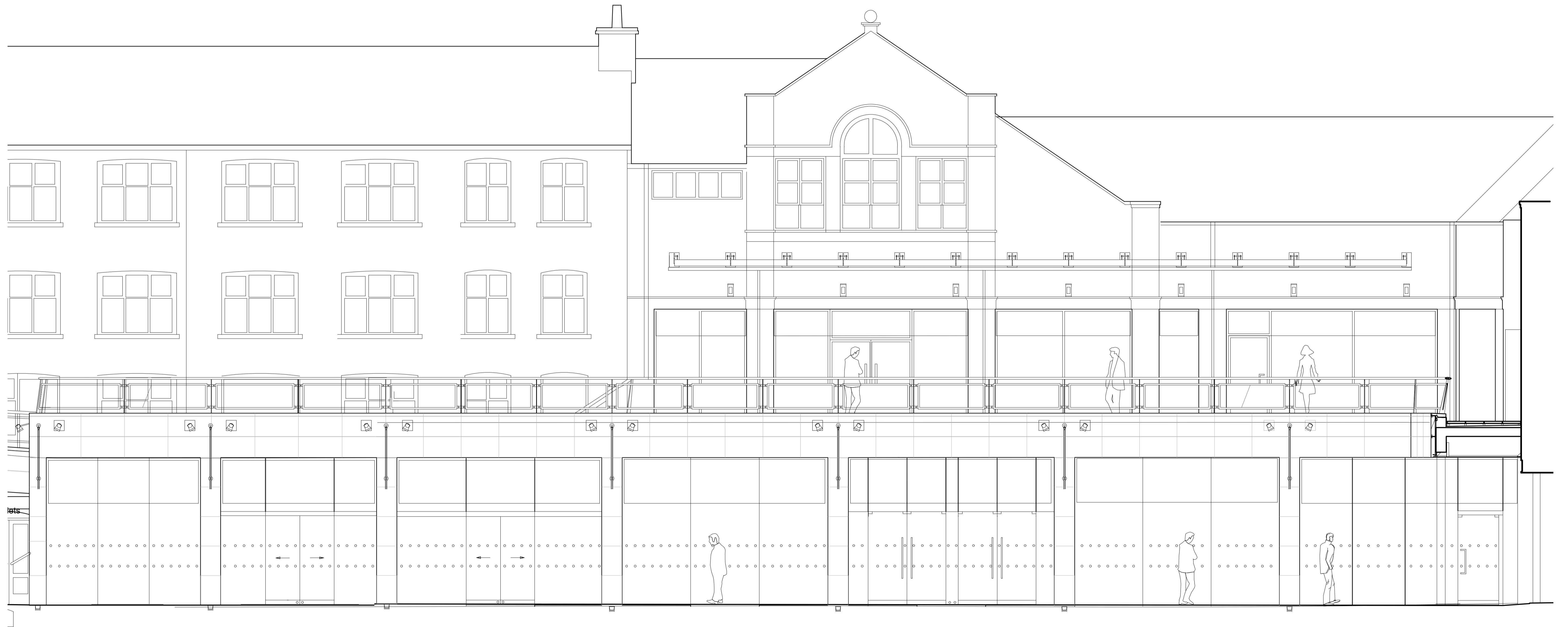
Elevation to Square